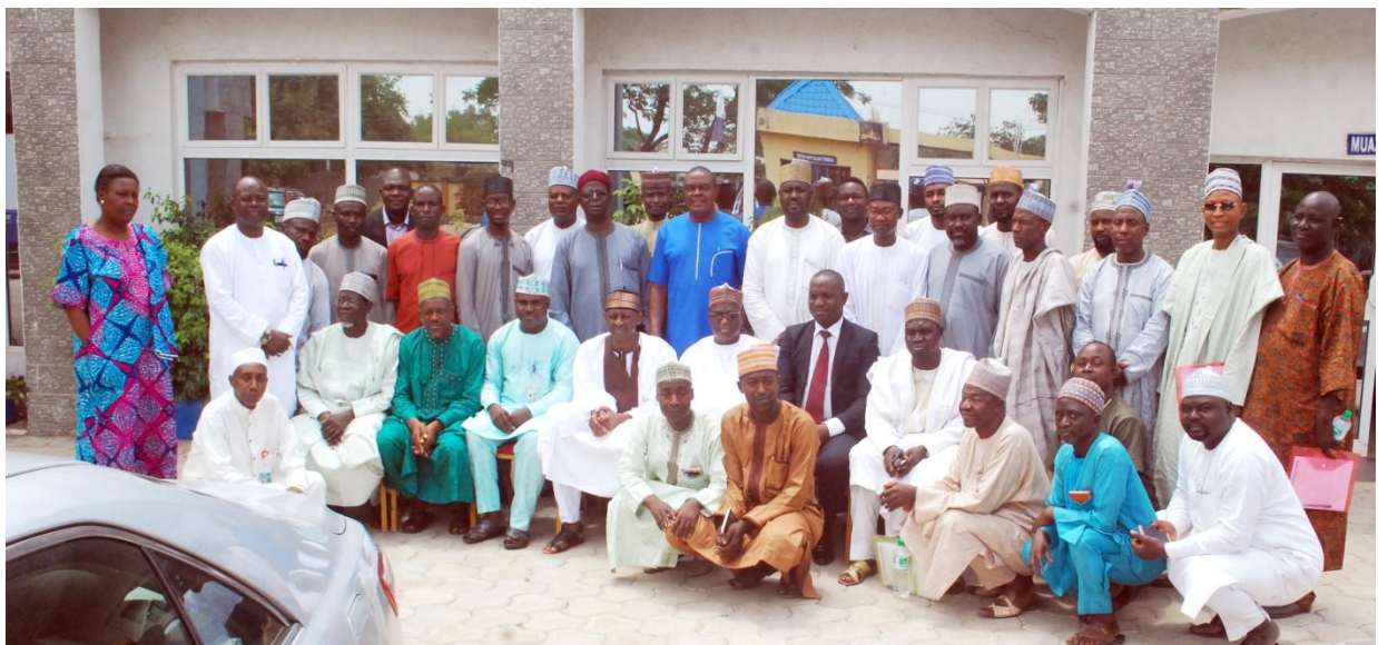
Group Photograph of the participants at the APRNet 8th Agricultural Policy Research Seminar at Bauchi, April 13, 2018

The APRNet's 8th Agricultural Policy Research Seminar was held at Bauchi Destination Hotel on 13 th April 2018. The Policy Seminar was supported by International Food Policy Research Institute (IFPRI). The specific aim of this particular Agricultural Policy Seminar at Bauchi was to (i) dialogue with Bauchi State agricultural stakeholders on strategies to improve water efficiency in agricultural production for increased agricultural productivity in the state and Nigeria, (ii) assess the problems of food safety and storage challenges in Nigerian agricultural value chain with evidence for policy making on food safety and storage in Nigeria, (iii) bring together multi-stakeholders in Nigerian agricultural value chain for networking and sensitization on new policies of the Federal Government of Nigeria and the State Government. It was generally a reflective stock-taking, information sharing and learning of best practices experience by the actors themselves. Just as researchers have responsibility to communicate with end-users, the end-users themselves should be able to tell their own stories too. Against this backdrop, the Agricultural Policy Research Network (APRNet), convened the 8 th Seminar series.