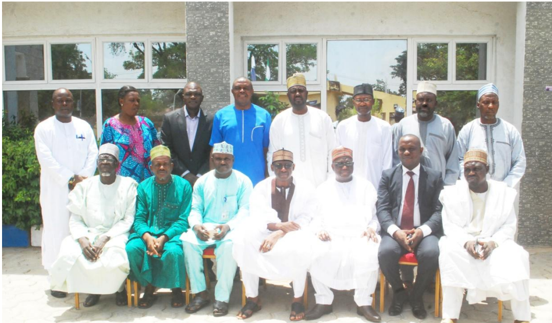
APRNet EXCO with Special Guests of Honour at the Policy Seminar