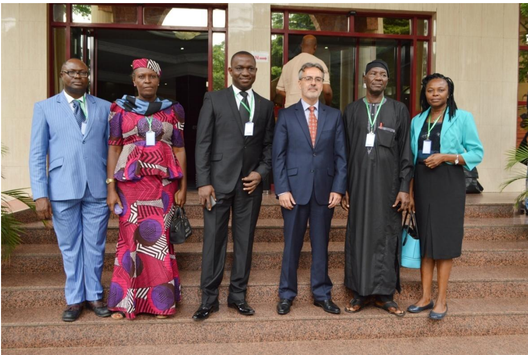
Some invited dignitaries with a few APRNet EXCO members at the Policy Forum