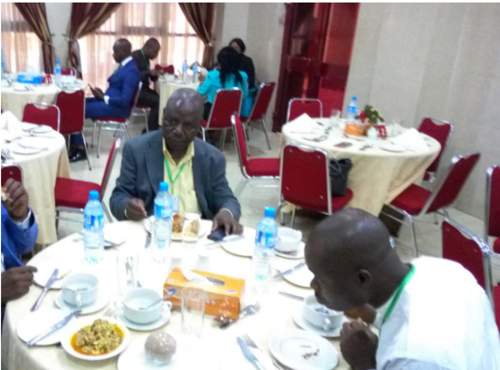
Lunch Session after a hard day's job. The event also had a tea break session.