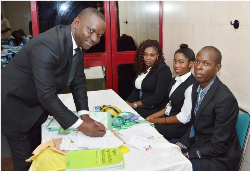
The registration desk at the Policy Forum on 23rd August, 2017