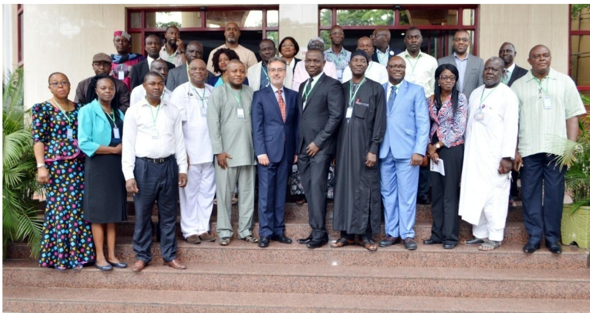
Group photograph of some participants at the morning session of 4th Multi-Stakeholders Forum of APRNet in Abuja, 23rd August, 2017

Organized by the Agricultural Policy Research Network (APRNet) on Wednesday, 23rd August 2017 at Valencia Hotel, Wuse II, Abuja, Nigeria